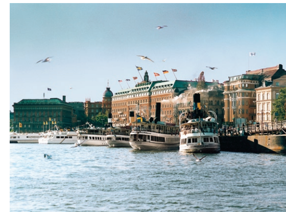
The Grand Hotel

** might be cancelled if no. of participants are too low