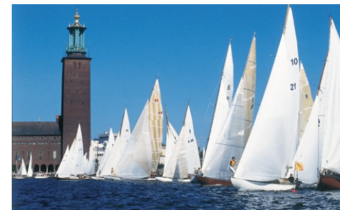
The City Hall