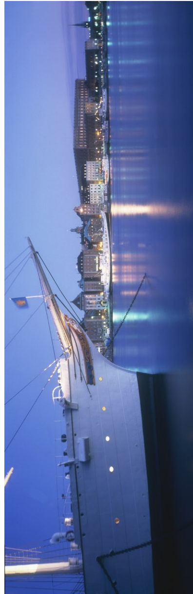
The ship Af Chapman in front of the Royal Castle