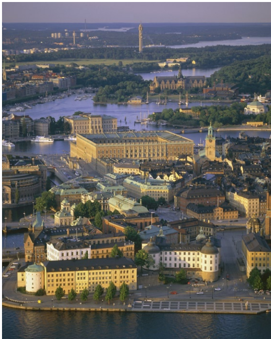
The Old Town with the Royal Castle